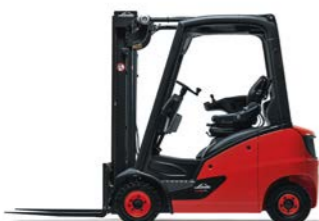
391 Series 1.4 Ton - 2.0 Ton Diesel / LPG Hydrostatic Max Lift Height: 6,000mm