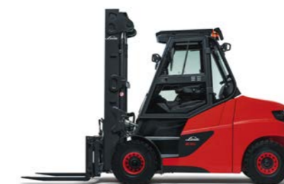
1279 Series 6.0 Ton - 8.0 Ton/ 900mm LC 4 Wheels Configuration Max Lift Height: 8,600mm