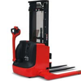
1172 Series 1.0 Ton - 1.2 Ton Pedestrian Max Lift: 4,386mm