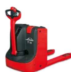
1151 Series 1.6 Ton - 2.0 Ton Pedestrian Travel Distance: Short Operation Type: Medium