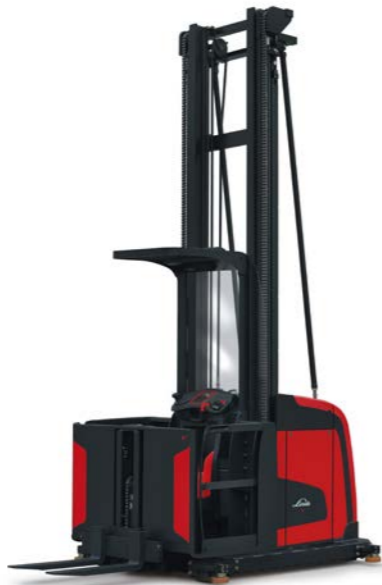
5214 Series 1.2 Ton Picking Height: 12,000mm Travel Speed: 13km/hr *Modular Concept