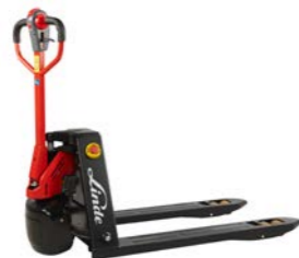
1131-02 Series 1.5 Ton Battery-operated Travel Distance: Short Operation Type: Light