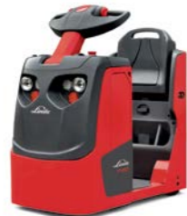
1193 Series 2.0 Ton Indoor / Outdoor Stand On Max Speed: 8km/hr