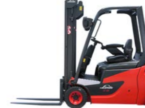
1275 Series 1.6 Ton - 2.0 Ton 3 / 4 Wheels Configuration Max Lift Height: 6,220mm