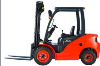
6006 Series 2.5 Ton - 3.5 Ton Diesel / LPG Torque Converter Max Lift Height: 6,500mm