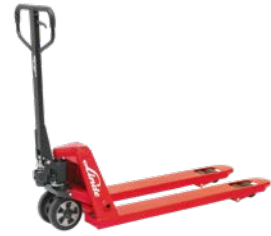
032 Series 2.0 Ton - 3.0 Ton Manual Operation Travel Distance: Short Operation Type: Light