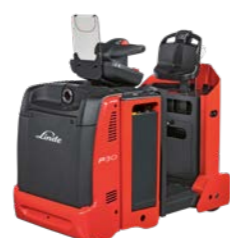
1189 Series 3.0 Ton - 5.0 Ton Indoor Stand On Max Speed: 10km/hr