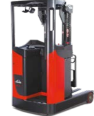
1123 Series 1.4 Ton - 1.8 Ton Indoor Stand On Max Lift: 6,220mm