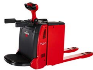
1158-20 Series 2.0 Ton Foldable Platform Travel Distance: Medium Operation Type: Medium