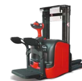
1183 Series 1.4 Ton - 2.0 Ton Pedestrian / Platform Max Lift: 5,316mm