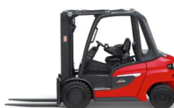
1202 Series 2.0 Ton - 3.5 Ton Diesel / LPG Hydrostatic Max Lift Height: 7,780mm