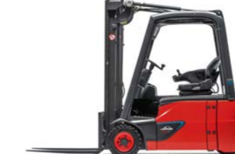
386 Series 1.2 Ton - 2.0 Ton 3 / 4 Wheels Configuration Max Lift Height: 6,000mm