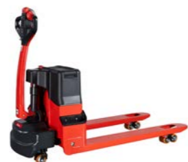
1132-02 Series 1.5 Ton - 2.0 Ton Battery-operated Travel Distance: Short Operation Type: Light