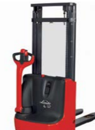
1169 Series 1.0 Ton - 1.4 Ton Pedestrian / Platform Max Lift: 4,266mm