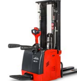
1165 Series 1.6 Ton Pedestrian / Platform Max Lift: 4,970mm