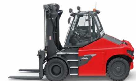
1471 Series 10.0 Ton - 18.0 Ton 4 Wheels Configuration Max Lift Height: 7,000mm