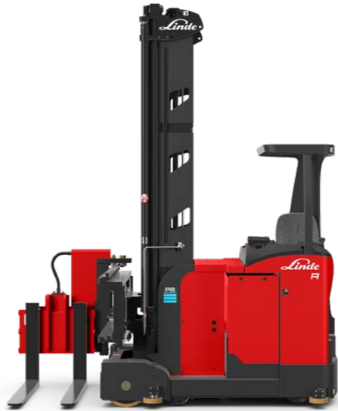
5224 Series 1.5 Ton Max Lift: 12,800mm Man-Down Truck *Modular Concept