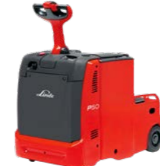
131 Series 5.0 Ton Indoor Pedestrian Max Speed: 6km/hr