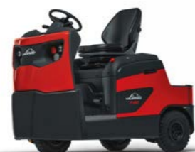
1191 Series 6.0 Ton - 8.0 Ton Indoor / Outdoor Seated Max Speed: 20km/hr