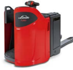
1158 Series 2.0 Ton - 3.0 Ton Fixed Platform Travel Distance: Long Operation Type: Heavy