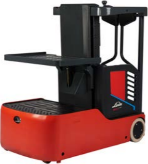
8905 Series 0.2 Ton Stand On Travel Speed: 6.5km/hr