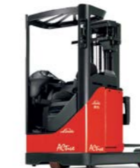
115 Series 1.6 Ton - 2.0 Ton Indoor Seated Max Lift: 12,155mm