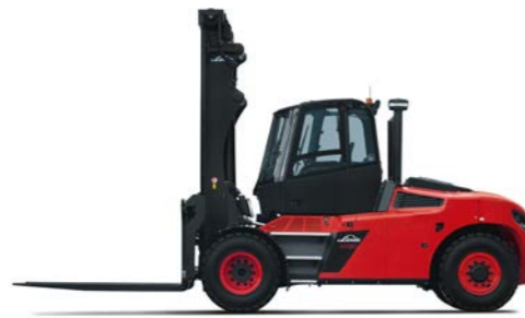
1401 Series 10.0 Ton - 18.0 Ton/1200mm LC Diesel Hydrostatic Max Lift Height: 7,000mm