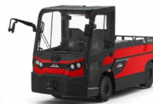
5007 Series 12.0 Ton - 35.0 Ton Indoor / Outdoor Seated Max Speed: 20km/hr