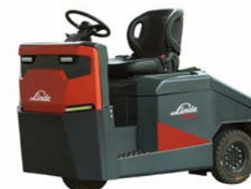
8910 Series 5.0 Ton - 6.0 Ton Indoor / Outdoor Seated Max Speed: 17km/hr