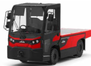
5007 Series Platform 2.0 Ton - 3.0 Ton platform Indoor / Outdoor Seated Max Speed: 20km/hr