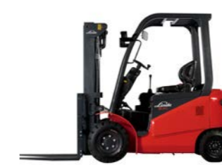
1293 Series 2.0 Ton - 2.5 Ton 4 Wheels Configuration Max Lift Height: 6,500mm