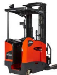
5195 Series 1.35 Ton Indoor Pantograph Max Lift: 10,700mm