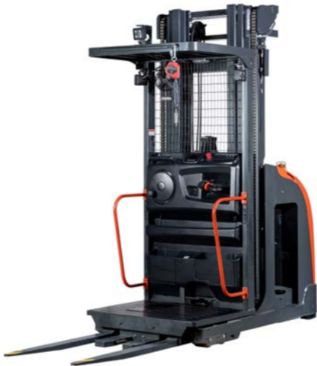
5215 Series 1.5 Ton Picking Height: 10,940mm Travel Speed: 9km/hr *Modular Concept