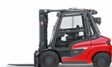
1204 Series 3.5 Ton - 5.0 Ton Diesel / LPG Hydrostatic Max Lift Height: 7,300mm