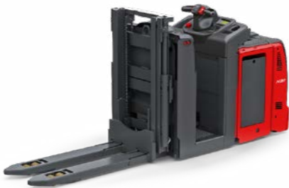
1110 Series 2.0 Ton Stand On Travel Speed: 10km/hr *With raised platform