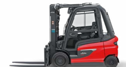
1252 Series 2.0 Ton - 3.0 Ton 4 Wheels Configuration Max Lift Height: 7,700mm