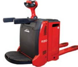
1158 Series 2.0 Ton - 3.0 Ton Foldable Platform Travel Distance: Long Operation Type: Heavy