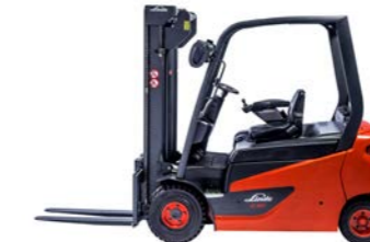
1276 Series 2.5 Ton - 3.5 Ton 4 Wheels Configuration Max Lift Height: 6,600mm