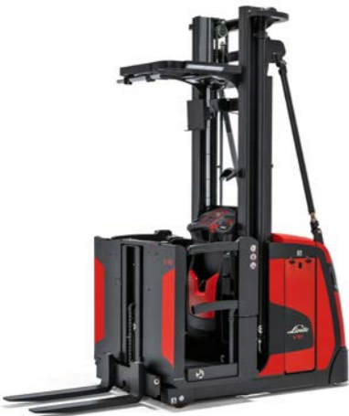
5021 Series 0.8 Ton - 1.0 Ton Picking Height: 6,350mm Travel Speed: 10km/hr *Modular Concept