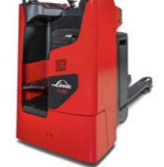
1154 Series 2.0 Ton Rider Travel Distance: Long Operation Type: Heavy