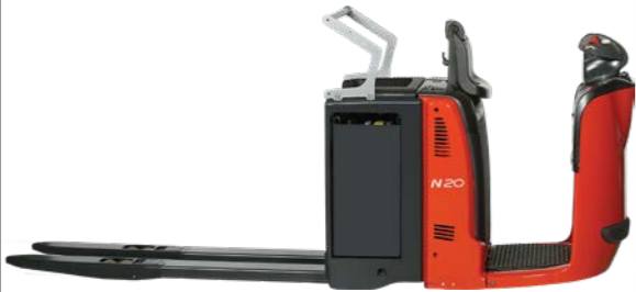
1159 Series 2.0 Ton - 2.4 Ton Stand On Travel Speed: 12km/hr