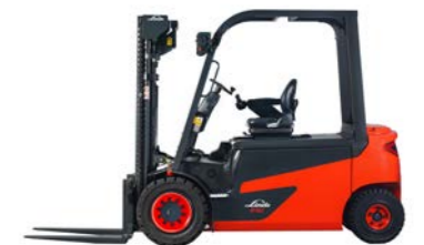
1287 Series 4.0 Ton - 5.0 Ton 4 Wheels Configuration Max Lift Height: 6,700mm