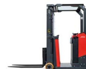
8917 Series 1.0 Ton Stand-On Max Lift Height: 5,300mm