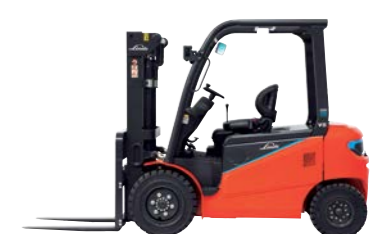
1294 Series 3.0 Ton - 3.5 Ton 4 Wheels Configuration Max Lift Height: 6,500mm