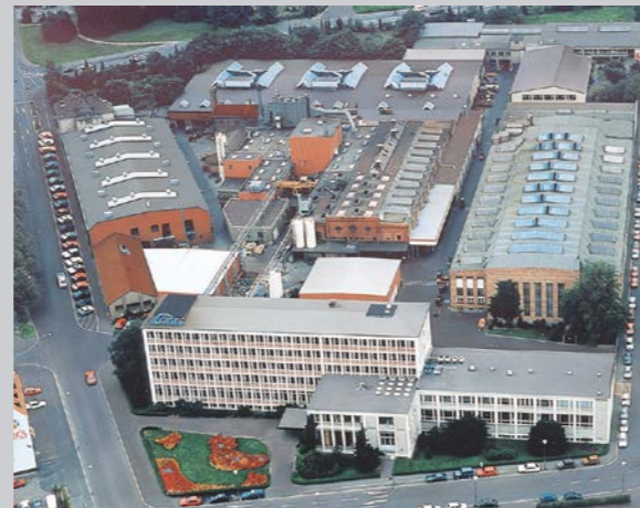
Head Office, Aschaffenburg, Germany

Linde Material Handling Asia Pacific Pte Ltd was established in Singapore in 1994 and is a wholly owned subsidiary of the German manufacturer.