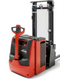
1171 Series 0.6 Ton - 1.6 Ton Manual Pedestrian Max Lift: 4,266mm