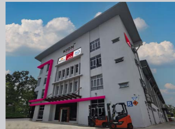
Shah Alam, Malaysia