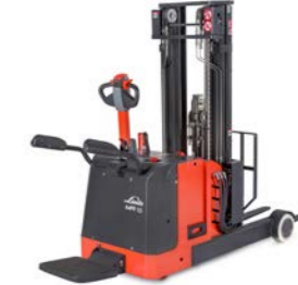
1166 Series 1.2 Ton - 1.5 Ton Pedestrian Max Lift: 4,500mm