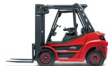
396 Series 5.0 Ton - 8.0 Ton/1100mm LC Diesel / LPG Hydrostatic Max Lift Height: 9,000mm