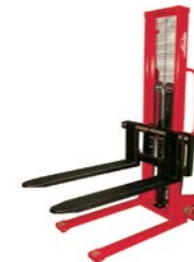
1016 Series 1.0 Ton Manual Pedestrian Max Lift: 1,600mm