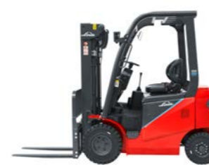
1292 Series 1.5 Ton - 2.0 Ton 4 Wheels Configuration Max Lift Height: 6,000mm