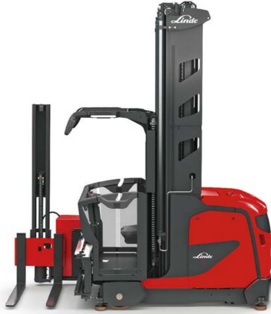
5231 Series 0.7 Ton - 1.5 Ton Max Lift: 18,000mm Man-Up Truck *Modular Concept