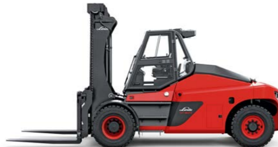
1411 Series 10.0 Ton - 18.0 Ton Diesel Torque Converter Max Lift Height: 7,000mm