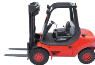
352 Series 3.5 Ton - 5.0 Ton Diesel Hydrostatic Max Lift Height: 6,700mm