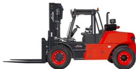
1408 Series 8.0 Ton - 10.0 Ton Diesel Torque Converter Max Lift: 6,000mm