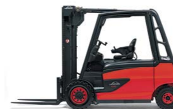
388 Series 3.5 Ton - 5.0 Ton/ 600mm LC 4 Wheels Configuration Max Lift Height: 6,300mm