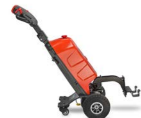
8904 Series 1.3 Ton Indoor Pedestrian Max Speed: 4.5km/hr