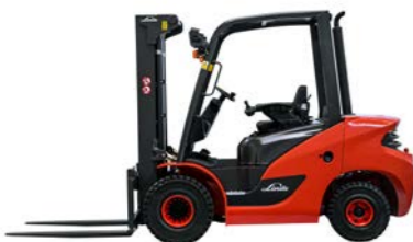
1220 Series 2.5 Ton - 3.5 Ton Diesel / LPG Hydrostatic Max Lift Height: 6,600mm