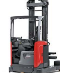
8923 Series 2.0 Ton - 2.5 Ton Indoor / Four way Seated Max Lift: 9,650mm