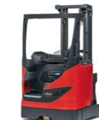
1120 Series 1.0 Ton - 2.5 Ton Indoor/Outdoor/Narrow Seated Max Lift: 12,955mm